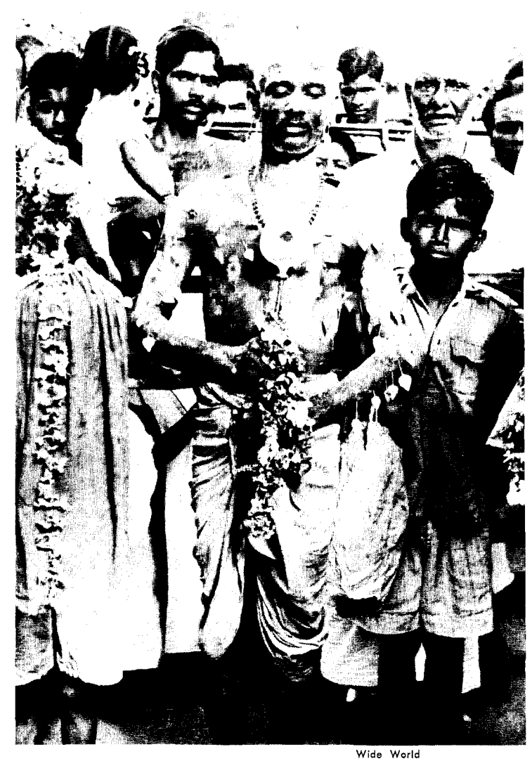
PENANCE — Body of devout Hindu in Madras, India, is pierced by shafts of tiny metal spears. Many today erroneously believe self-torture is pleasing to God and falsely assume fasting is penance.

COMMENT: In the Bible "fast" and "humble" often mean the same thing. Often it will be expressed "he humbled himself before God." This means that he fasted before God! So when you see the command to humble yourself, it usually means to fast.