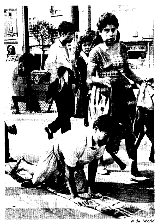
Penance of any kind is loathsome to God!

COMMENT: God will not hear their prayers because they are not willing to put sin out of their lives. They want the blessings of God without putting out the very agent — SIN — that cuts them off from God and brings curses upon them!